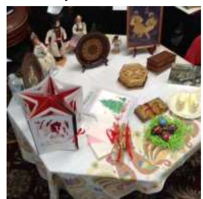
Table of Polish family "treasures."