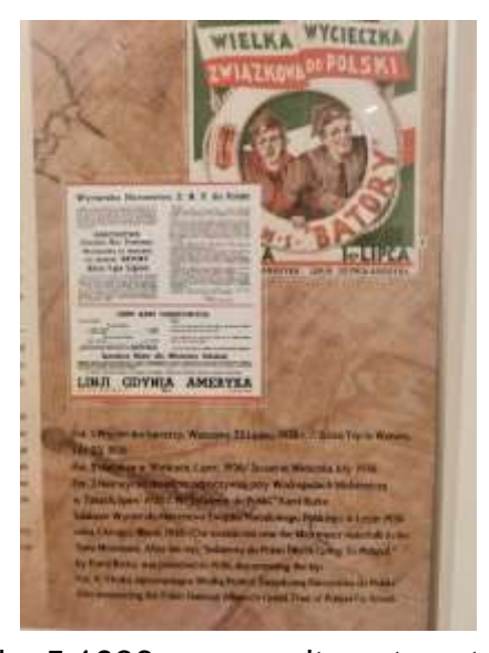
Fig. 5 1936 era recruitment poster.