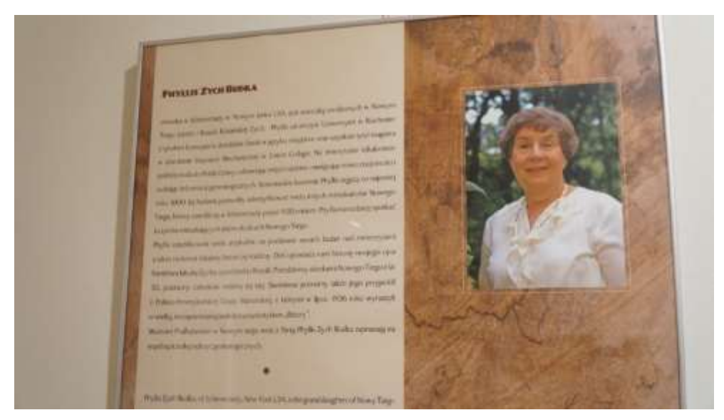
Fig. 4 How nice to be included in the exhibit!