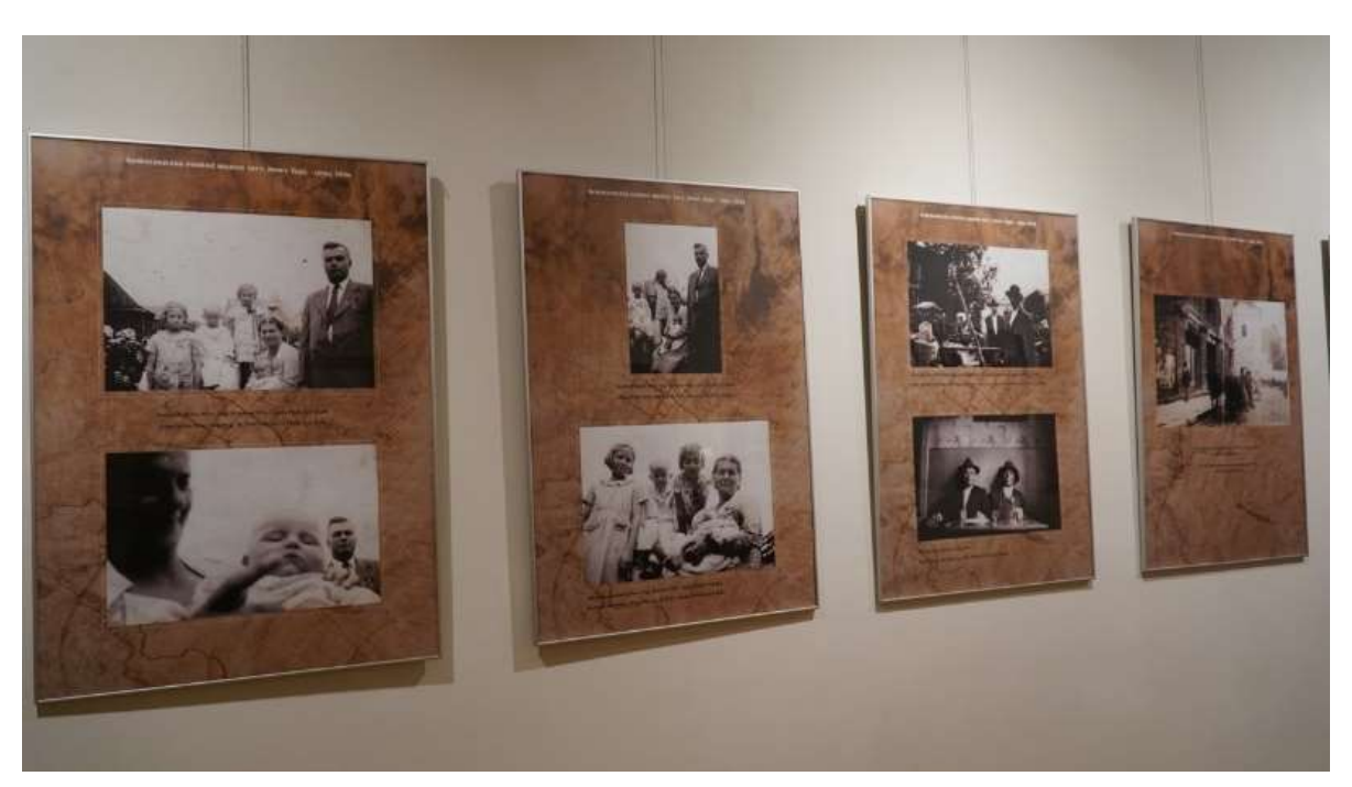
Fig. 8 A variety of pictures