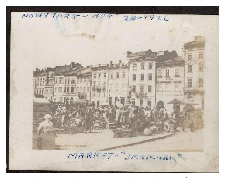
Nowy Targ Aug 20 1936 – Market ' "Jarmark" To learn more, see page 8